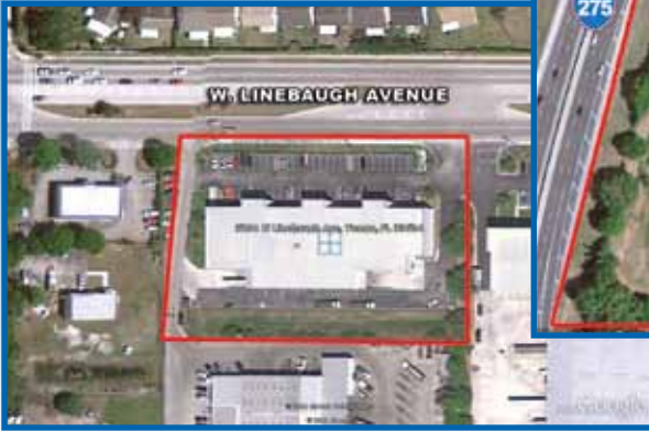
5204 W. Linebaugh Avenue