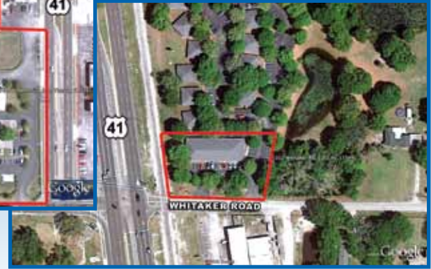
Lutz Landing - 102 Whitaker Road